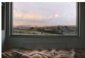
Hall 3.1 World wonders and the unknown