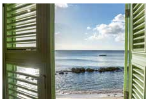
Hall 3.0 Sun and more