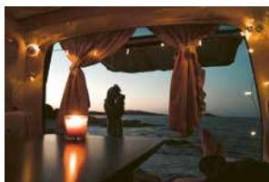
Hall 9.1 Camping and adventure