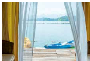
Hall 2.0 Leisure and fun

Do you offer a mountain experience? Is fine dining your speciality? Do your guests enjoy relaxing in your wellness oasis or exploring the surrounding countryside? Then Hall 2.1 Alpine air and well-being is the perfect place for you. We are also happy to advise you on the other halls.